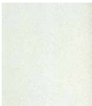
Soft Speckle | Pearl