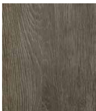
Black Forest | Fusion