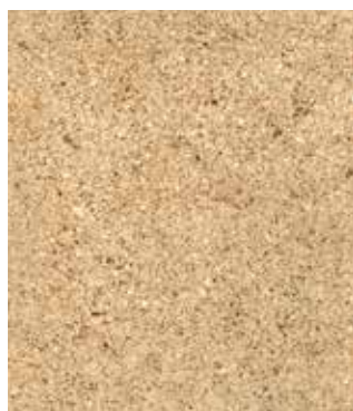
Sahara Sand | Quarry