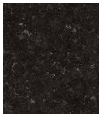
Carbon Black | Quarry