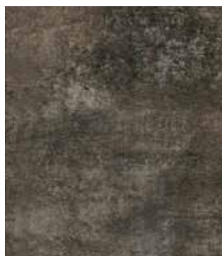
Buffalo | Stone