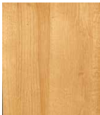
English Oak | Fusion