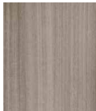
Driftwood | Fusion