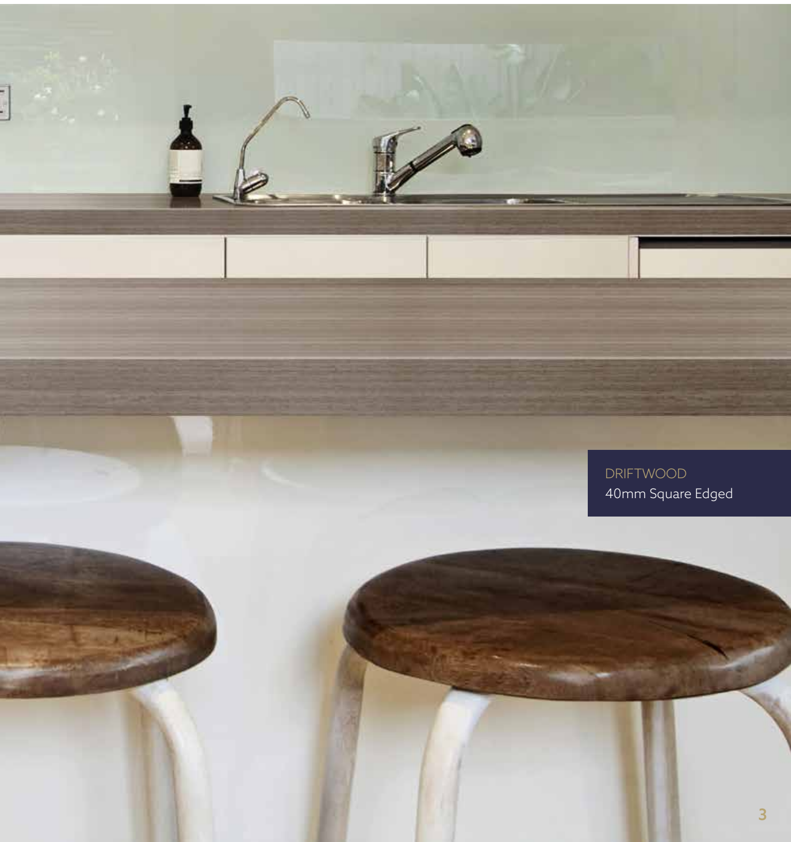
DRIFTWOOD 40mm Square Edged

Welcome classic style into your home with the Heritage range of naturally beautiful worktops. Inspired by nature, the Heritage range provides a select palette of stones and woodgrains that will provide that touch of individual expression. Designed for contemporary living, Heritage worktops possess an enduring quality of style and functionality that will stand the test of time. Available in both 'square edged' and traditional 'bullnose' profiles, the Heritage worktop range has the versatility of style, shape and form to fit seamlessly into your dream kitchen.