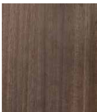
Colonial Oak | Fusion