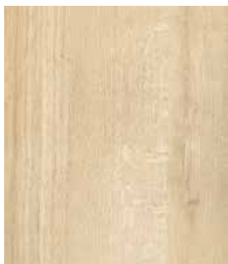
Baltic Oak | Fusion