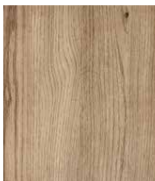
Hampshire | Fusion