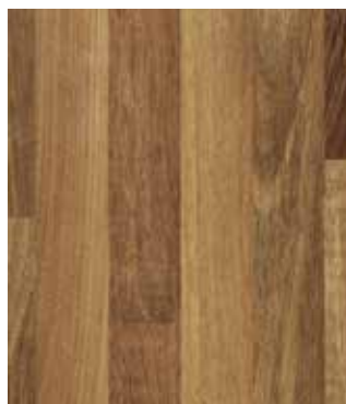
Butcher's Block | Pearl