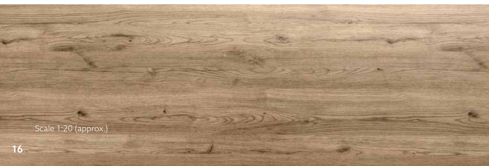
Scale 1:20 (approx.)