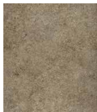
Lunar Grey | Quarry